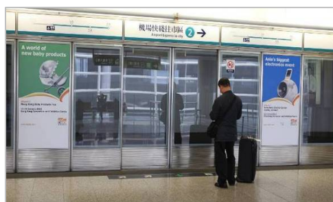
6. MTR Airport Express platform screen door ad