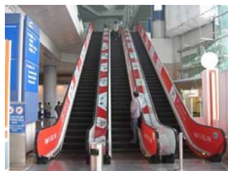
1. Escalator ad

* available for Hong Kong exhibitors only