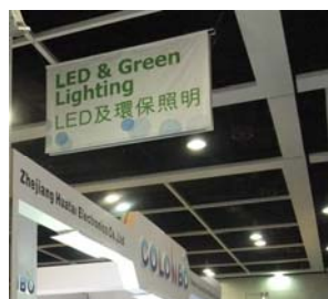
3b. Overhead hanging banner above booths