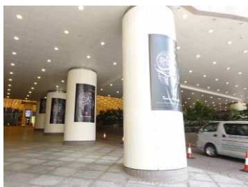
3c. Pillar banner at Harbour Road entrance