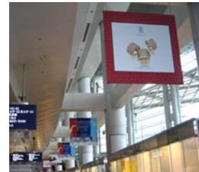
3a. Overhead hanging banner along Hall 1 concourse