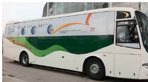
4. Shuttle bus sticker ad