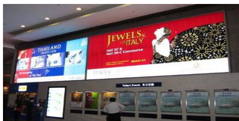
2a. Lightbox at Harbour Road entrance